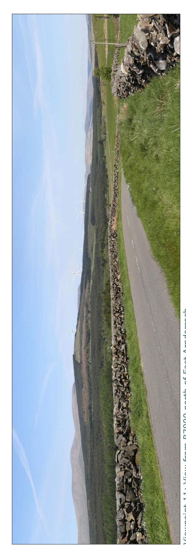
Viewpoint 11: View from B7000 north of East Arndarroch Note: Images for illustrative purposes only. For accurate representation and further details please view the A1 photomontages in the LVIA which will be Figures 8.46c and 8.47c.